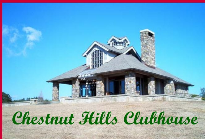
Chestnut Hills Clubhouse

Directions: I-26 to Piney Grove Rd. Turn Right on Piney Grove Rd. Go about 100 yds. and take a left on Piney Woods, which runs through Harbison and leads to the traffic light on Broad River Road. Go straight across Broad River and Piney Woods becomes Lost Creek Drive. Go straight on Lost Creek, less than 3 miles until you see the Clubhouse on the right next to the lake.